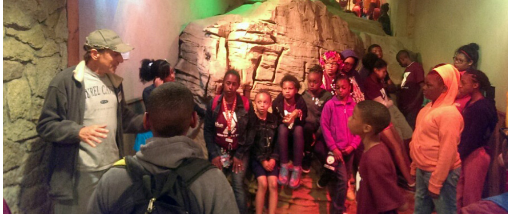
Tickets for Kids distributed free tickets and admission to a variety of events and attractions including Laurel Cavern.

Tickets for Kids distributed more than 5,000 tickets – valued at $105,000 – free of charge to 15 organizations and agencies serving homeless children. The ticket distribution program provides free tickets and admission to cultural, arts, sports and entertainment venues for low-income children and their families.