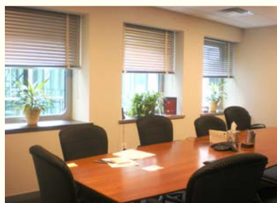
PCGF's new conference room

While office space occupies floors 3 - 14, approximately 240 luxury apartments are available on floors 15 - 31. The renovated building will feature a state-of-the-art fitness center and community lounge. Two new restaurants will open in addition to Simpatico, the fresh juice and coffee bar currently operating in the lobby. Vallozzi's Pittsburgh, currently serving authentic Italian cuisine at its Fifth Avenue location in Downtown Pittsburgh, will open in the spring.